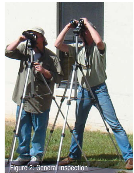
Figure 2: General Inspection

The façade of the building is then generally inspected, thoroughly and methodically by visually scanning the exterior both horizontally and vertically with tripod mounted binoculars, and deficiencies are documented with the aid of a camera with a telephoto lens. See Figure 2. The condition of the roofing and parapets are also observed, as they could be sources of moisture within the façade. The purpose of the general inspection is to identify anomalies that require close-up detailed inspection.