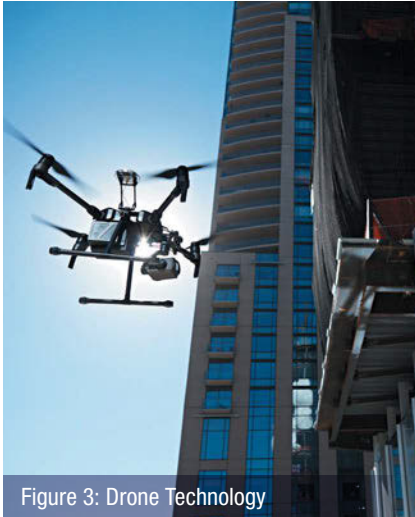
Figure 3: Drone Technology