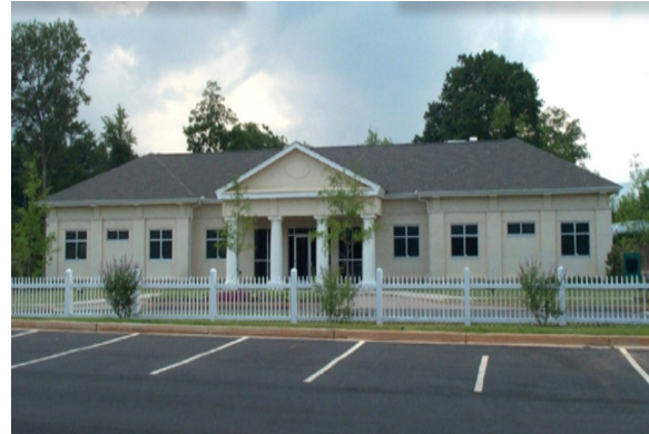
Plastic Surgery Center of Athens

New entrance vestibule, damage limiting construction, load bearing wall removal, and thru-roof HVAC support platforms with architectural screens.