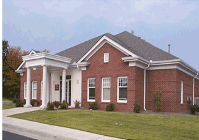
Hawthorne Internal Medicine

(IEI) brings more than a decade of experience providing structural engineering and design services for medical offices, laboratories and related healthcare facilities. We understand that the rising cost of healthcare is mandating new perspectives on the kinds and types of healthcare facilities that are being built today. IEI provides solutions that are current with technological advancements in medical equipment and environmental systems, and takes into account the economic challenges of the healthcare industry. An example of our healthcare experience is presented below.