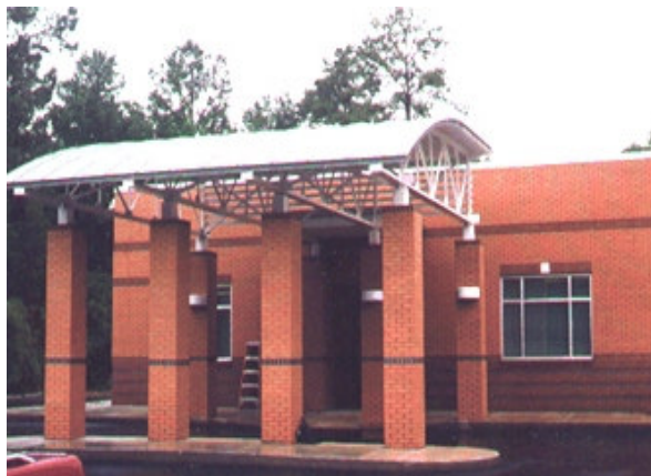
Wilcox County Dialysis Center

Two story 12,700 SF structural steel and light gauge wood frame medical office building with walkout basement.