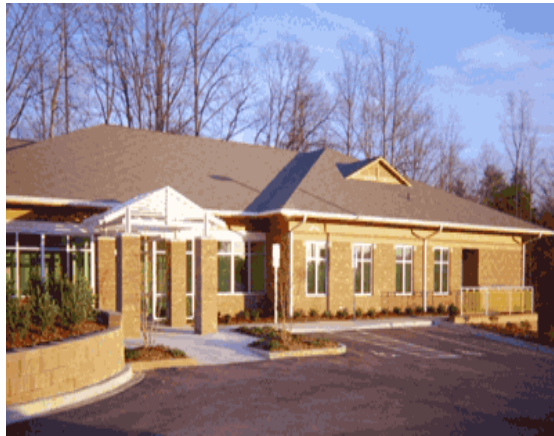
Morganton Medical Center